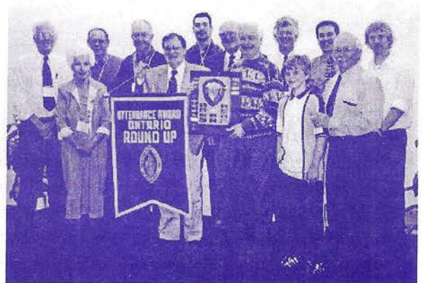
St. Paul's, Stirling Winners of the Attendance Award